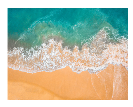
Establishing the number 1# Destination in Bali at Bali's Largest One-Stop Lifestyle Center.

Truly a visionary entertainment hub, with an active multicultural community that combines global inspiration with Indonesian talent and craft. Inviting and supporting the best of Bali has to offer. The people is at the core of what makes Atlas Beach Fest unique.