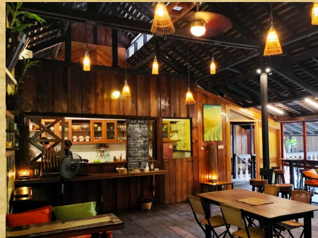
Kafé Kahiu food & events place