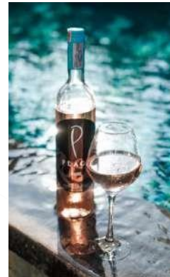
Local Wine from Plaga