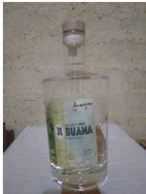
Balinese Arak (Alcohol) from Buana

Working closely with the local suppliers for the bathroom amenities, local suppliers for food, and other products.