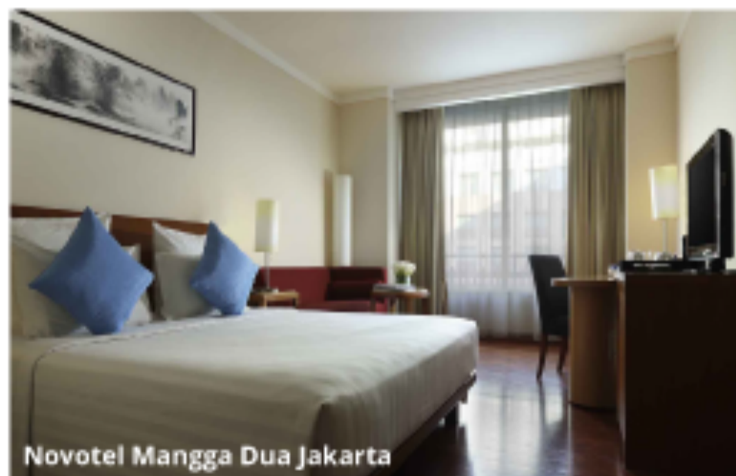
Novotel Mangga Dua Jakarta

8Days Jakarta Puncak Bandung for US$ 995 per-person