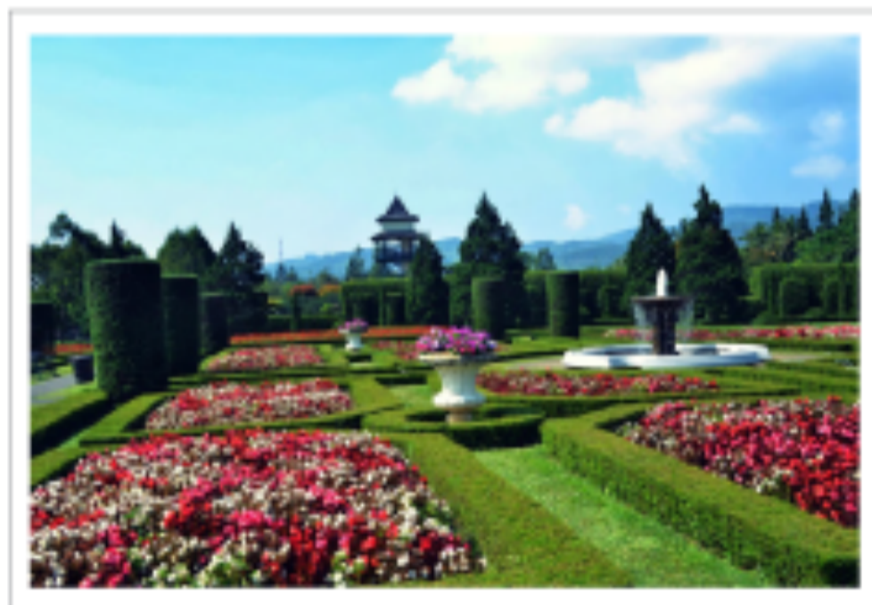
NUSANTARA FLOWERS PARK

You will enjoy your sixth day in Bandung with your own free-leisure time , be it more shopping, strolling at Cihampelas street for "Jean Experience", or visiting more modern outlets in either Cihampelas Walk or Paris van Java mall. If you wish, you may take optional tours such as Tangkuban Perahu Crater or White Crater tour, Ciater Hot Spring tour, or Bamboo music performance.