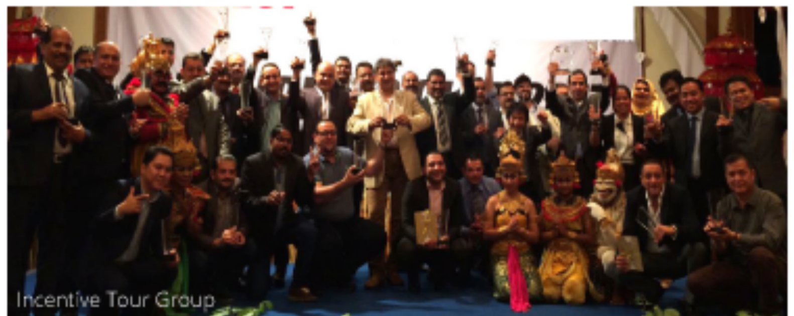
Incentive Tour Group

Innovation is also the fore front of our solutions. With continuous New Product Developments , we release new products in regular basis. We listen to our customers and guests. We try our best to understand them and at the end we create new products based on their "voices".