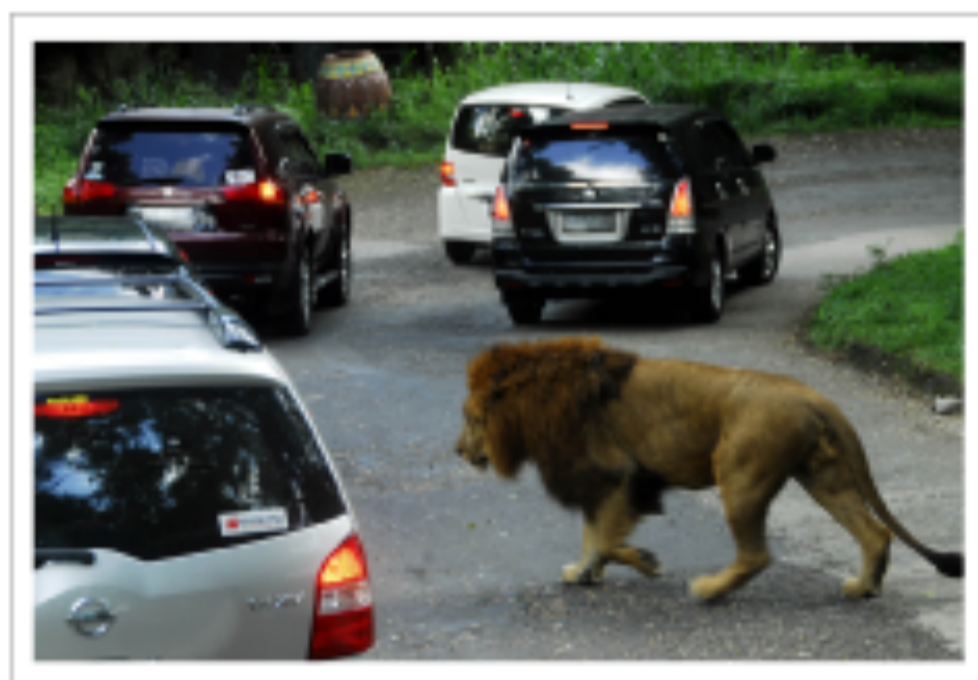
INDONESIA SAFARI PARK