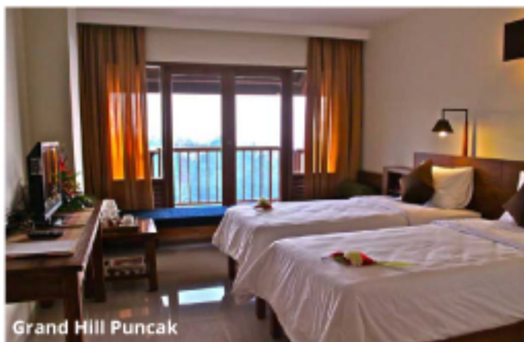
Grand Hill Puncak

On your last day, the eight day, make sure you have packed everything you buy in Jakarta, Puncak, or Bandung along with your beautiful memory. Our humble tour guide will then transfer you to Jakarta International Airport and say "Bye bye and see you again".