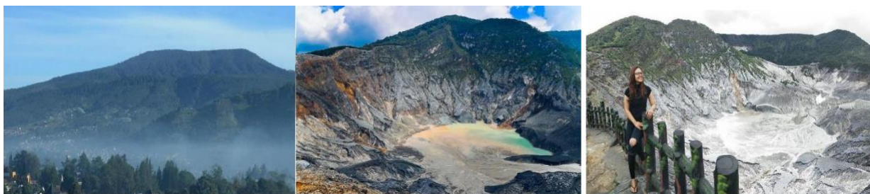
Tangkuban Perahu Volcano

Breakfast at Hotel. Drive approx 2 hours to visit Tangkuban Perahu, Dusun Bambu, and Rainbow Waterfall (only seeing on distance). Afterwards checkin hotel in Bandung city area at Sheraton Bandung Hotel at Deluxe Room. www.marriot.com