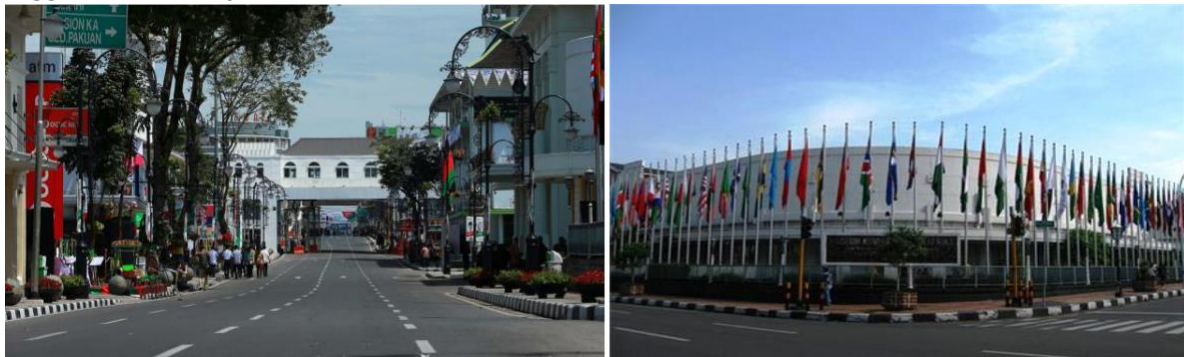
Asia Afrika Museum