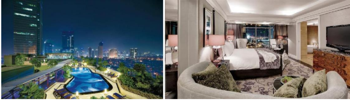
Kempinski Jakarta Deluxe Room