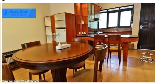
Living Room , kitchen & Dining Room