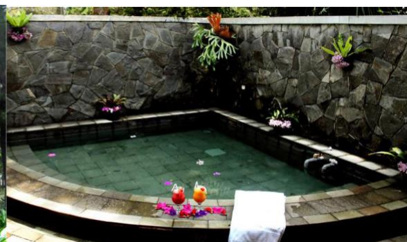
Family Suite Bungalow 2 Bed Rooms