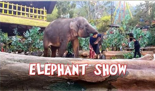
Taman Safari Bogor