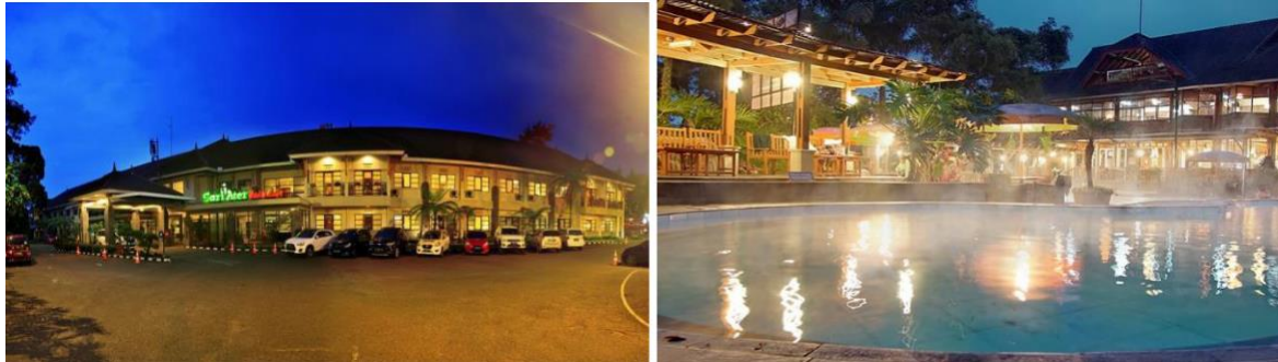
Sari Ater Resort & Spa

Breakfast at Hotel. Free day on own leisure. Overnight at the same Hotel. (10.00 – 18.00 guide and car would be standby for assist your activity, all entrance fee of all tourism object cover by personal expenses)