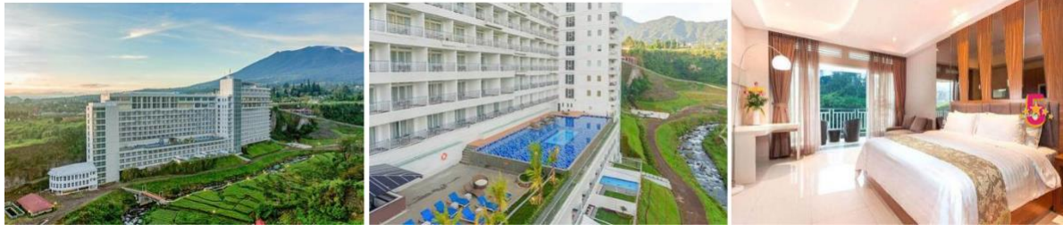
Junior Suite Le Eminance

Arrive at Soekarno Hatta International Airport by .... welcome & greeting by our guide then continued transfer to Puncak and check in Le Eminance Hotel at Suite Room https://www.le-eminencepuncak.com/