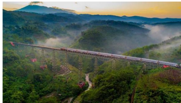
The beautiful scenery of train journey Jakarta - Bandung – Jakarta