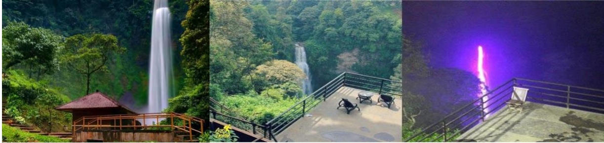
Curug Cimahi Rainbow Waterfall